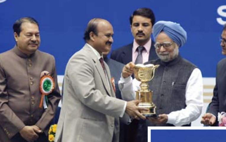
The ceremony included a film on the functioning and contribution of the Public Sector-'Pulsating Pillars', that traced the history of the PSEs to their present commanding and all -pervasive presence in society and industry alike. Resplendent in hues of blue and white and gold, the bedecked hall and tastefully decorated stage, augmented by the dulcet voice of the presenter and the glow of celebration that enveloped the gathering, the ceremony left all present with lingering memories of success, acclaim, approbation and camaraderie-a standpoint of combined effort towards a better tomorrow for the nation, the sector, the people.