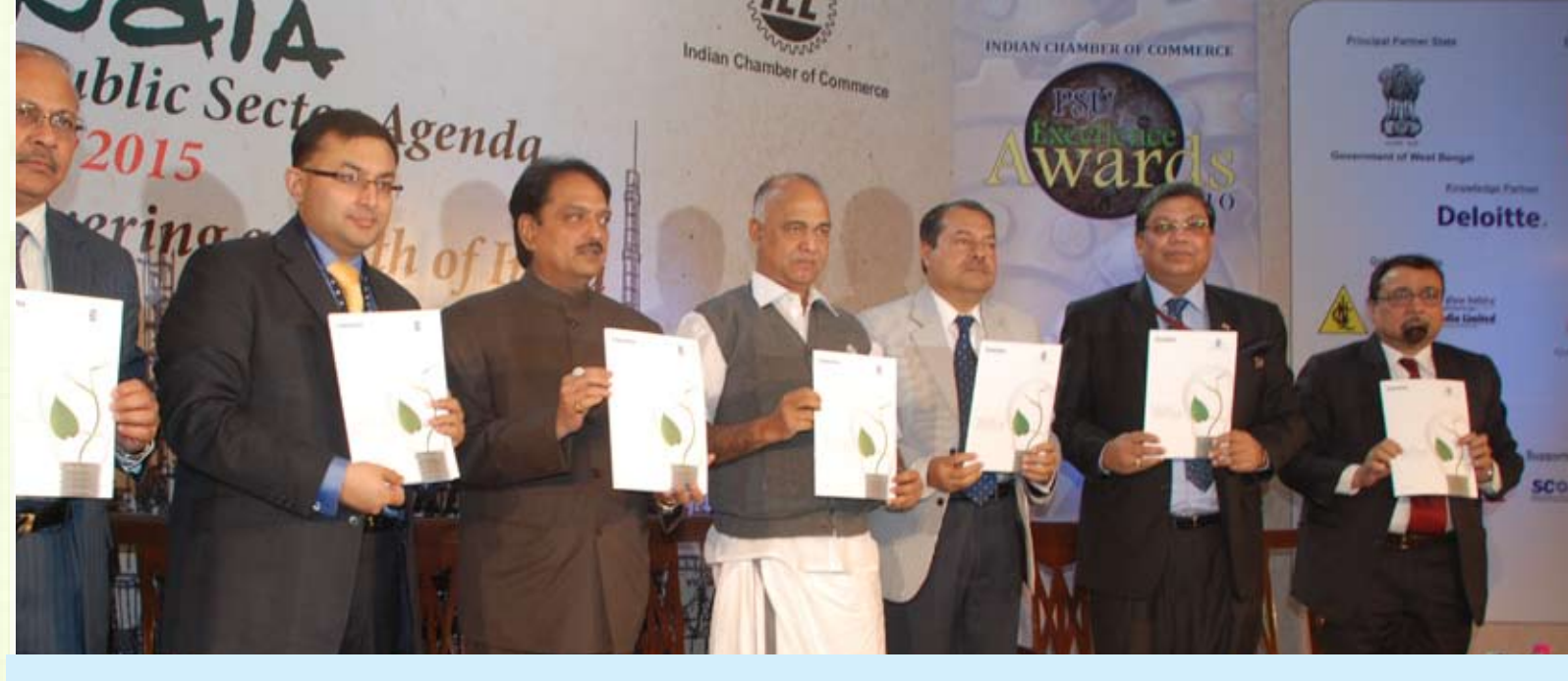
Release of publication on Public Sector at the PSU Excellence Awards, Indian Chamber of Commerce

Speaking of the pitfalls of unrestricted privatization as demonstrated in the recent global down-turn, Shri Elamaram Kareem, Hon'ble Minister of Industries, Government of Kerala, applauded the role played by PSEs, especially the Navratna and the Miniratna companies, as contributors to the state exchequer besides providing large scale employment.