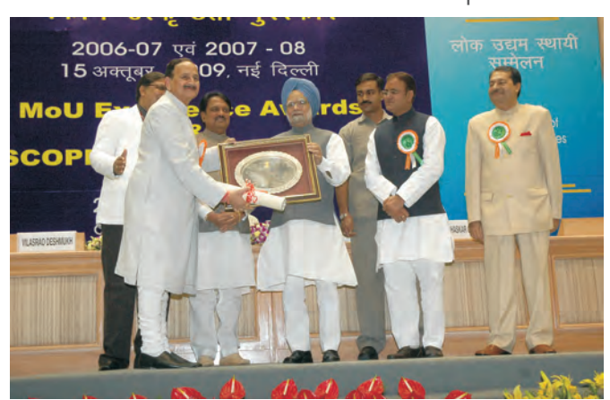
Hon'ble PM giving MoU Excellence Awards

Four CPSEs received MoU Awards for two consecutive years for 2006-07 and 2007-08. These awardees were Container Corporation of