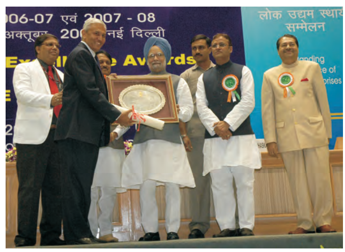
Hon'ble PM giving MoU Excellence Awards

Other MoU awardees for 2007-08 were Hindustan Paper Company Ltd (HPCL), Indian Oil Corporation (IOC), MMTC, PFC and WAPCOS. Award winners for 2006-07 were Bharat Heavy Electricals Ltd (BHEL), Bharat Petroleum Corporation Ltd (BPCL), Hindustan Aeronautics Ltd (HAL), Mineral Exploration Corporation Ltd (MECL), Manganese Ore India Ltd (MOIL), National Building Corporation of India (NBCC), National Backward Classes Finance & Development Corporation (NBCFDC) and State Trading Corporation of India Limited (STC).