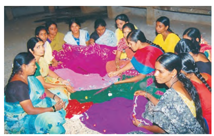
VRS optees from NTC attending training in Embroidery