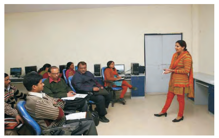
Trainees attending the class

The training programme mainly focuses on IT basics like internet technology, basic Windows application and basic Word 2007 concepts. Suitable incentives would be provided to those who pass the evaluation test at the end of the training programme.