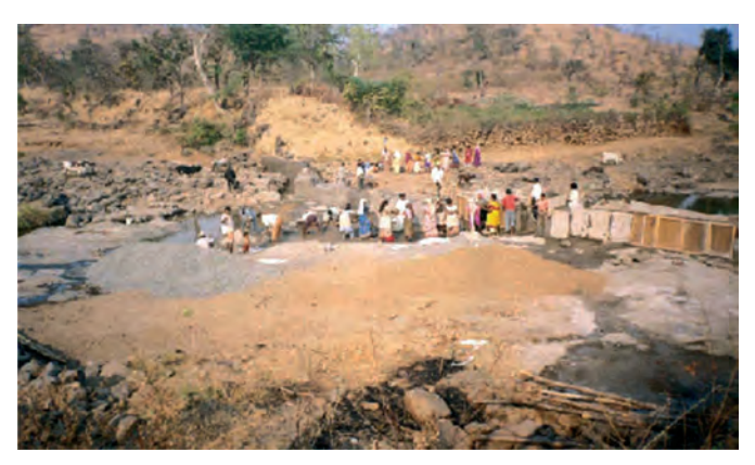
Rain water harvesting as CSR activity by Bharat Petroleum Corporation Ltd (BPCL)

CEOs of 17 Navratnas CPSEs had a unique opportunity of interaction with the Secretary, Department of Public Enterprises (DPE), the TISS faculty and a cross-section of NGOs. The DPE