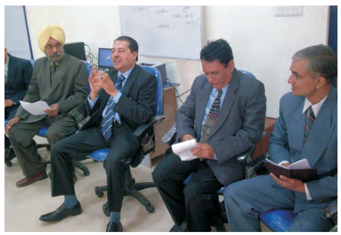
Secretary, DPE at the inauguration of IT training for DPE Staff

DPE joined hands with M/s Intelligent Communication System India Limited (ICSIL), a joint venture of TCIL and DSIDC, to provide professional training to DPE personnel on a long term basis.